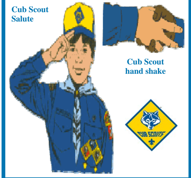
Cub Scout Salute

Dates to remember Rally Night: Sept. 8, 2009 Parent Orientation: Sept. 15, 2009 1st Pack Meeting: Sept. 29, 2009 TIME: 6:00 pm WHERE: 1st United Methodist Church of Bryan 506 E 28th, Bryan, TX COST: $8.00