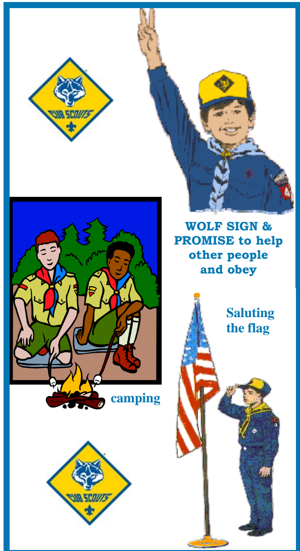
WOLF SIGN & PROMISE to help other people and obey