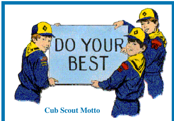
Cub Scout Motto

ACTIVITIES At den meetings, a Cub Scout starts an activity. Perhaps it is an advancement badge, a handicraft project, or practicing a stunt for the next pack meeting. During the week, with his parents' help, he finishes the project or perfects the stunt. If it happens to be something required for his Wolf or Bear advancement, his parent signs his Cub Scout book. In this way, Cub Scouting helps to strengthen family ties.